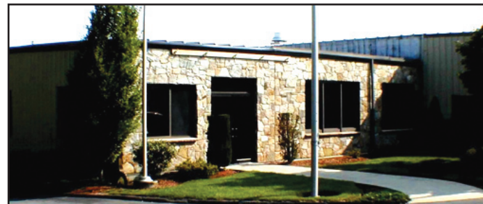
289 Elm Street, Marlborough. For sale/lease, 20,000 - 80,000 SF flex industrial building available immediately.