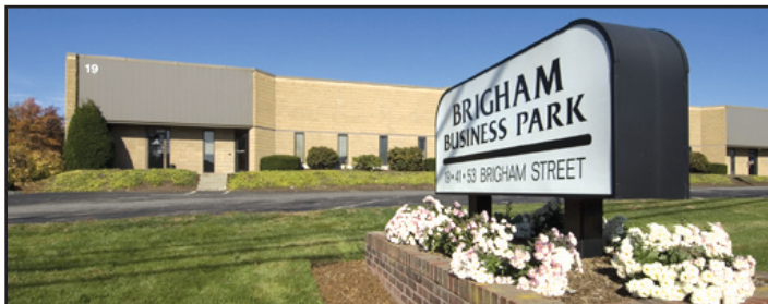
Brigham Business Park, Marlborough - For lease 1,500 SF - 7,500 SF, flex space great location near Mass Pike & I-495.