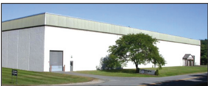
84 Ames Street, Marlborough. For lease, 30,000 SF with 35' clear, very clean warehouse, expansion if needed.