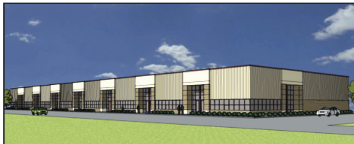
362 Elm Street, Marlborough. For sale/lease, 4,000 - 47,000 SF brand new flex building overlooking I-495. UN-REAL location.