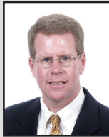
R.W. Holmes Realty Co.

Industrial properties along the Mass Pike & I-495 corridor are posting strong numbers for both sales and lease transactions. Locally, the Mass Pike & I-495 industrial availability is at 17.4%, down 2% from a year ago. 2008 is off to a fast start with showings on the rise for groups looking to lease or buy industrial locations in multiple size ranges. Furthermore, at least six