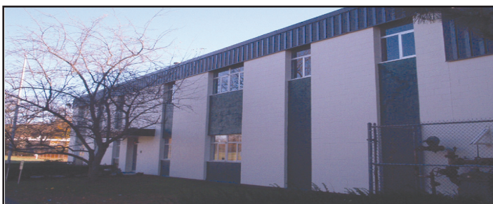
170 Bartlett Street, Northborough. For sale/lease, 35,000 SF industrial building ideal for manufacturing and assembly.