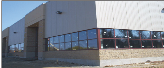
362 Elm Street, Marlborough. For sale/lease, 4,000 - 47,000 SF brand new flex building overlooking I-495. UN-REAL location.