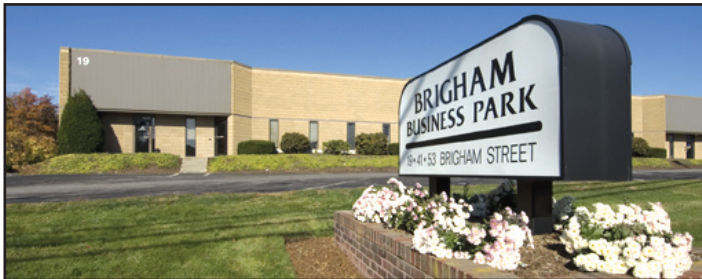
Brigham Business Park, Marlborough - For lease 1,500 SF - 7,500 SF, flex space great location near Mass Pike & I-495.