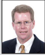
R.W. Holmes Realty

The “half-time” report for industrial properties in Massachusetts is positive for both sale and lease transactions. At the mid-year, 2008 is off to a good start with showings on the rise for groups looking to lease or buy industrial locations in multiple size ranges. Furthermore, at least six large industrial requirements in the 50-80,000 s/f range are out looking for new or expansion space in this sub market for occupancy in