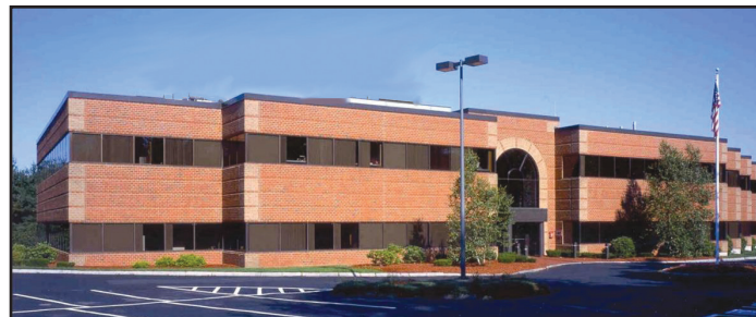
33 Locke Drive, Marlborough 3,000 - 20,000 SF for lease, great mix of office and lab space in move-in condition.