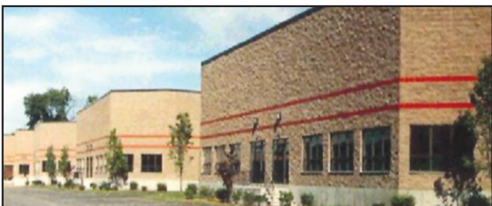
101-110 Clematis Ave., Waltham - For lease 2,000 - 15,000 SF, high-bay flex space in move-in condition.